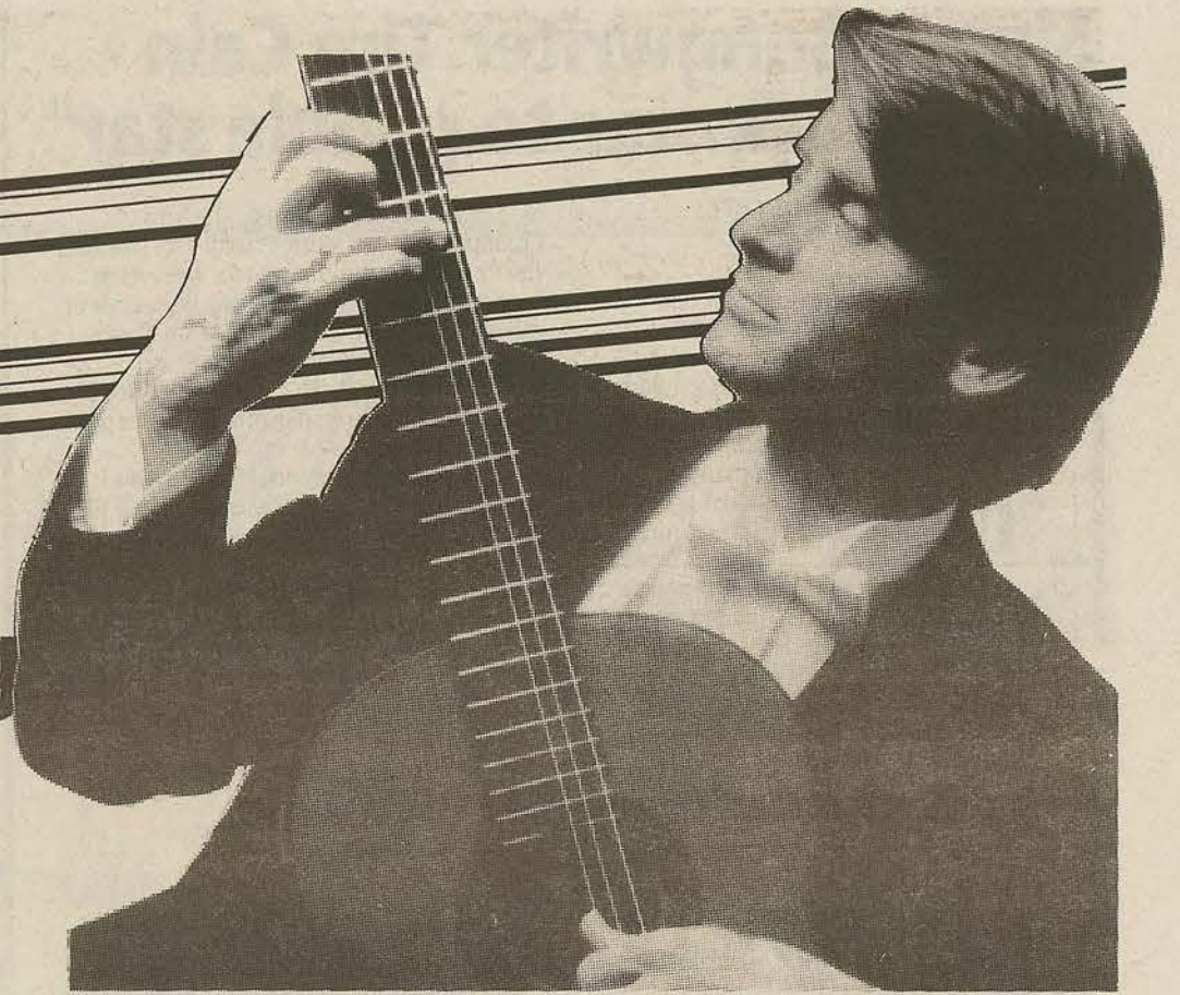
Classical guitarist Christopher Parkening will perform in concert Sunday, February 27, 3 p.m. at the Marin Veterans' Memorial Auditorium.

R anked as one of the world's preeminent virtuosos of the classical guitar, Christopher Parkening, the recognized heir to the tradition of the Andres Segovia, has a rare combination of dramatic virtuosity and eloquent musicianship.