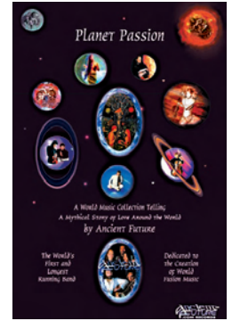
11 x 17 color poster