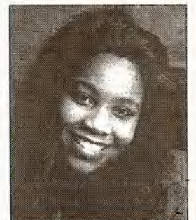
Address correspondence to BAM's South Bay office: 20 Harold Ave., #39, San Jose, CA 95117.