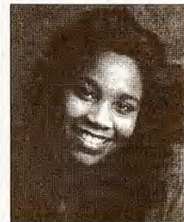
Address correspondence to BAM's South Bay office: 20 Harold Ave., #39, San Jose 95117.