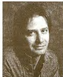
Address correspondence c/o BAM at 3470 Buskirk Ave., Pleasant Hill, CA 94523.