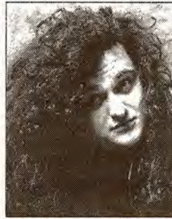
Address correspondence c/o BAM at 3470 Buskirk Ave., Pleasant Hill, CA 94523.

Before Lollapalooza 1993, advice on an album to buy: Treponem Pal's forthcoming Roadrunner release, Excess and Overdrive . Electro-aggro with repetitive, industrialized guitar battering of the highest order, this points the direction where we all hope Min-