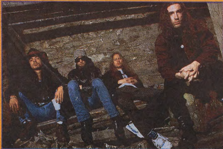
ALICE IN CHAINS

America's Monstro-Vaudevillian, Post-Aquarian Rock 'n' Roll Revue