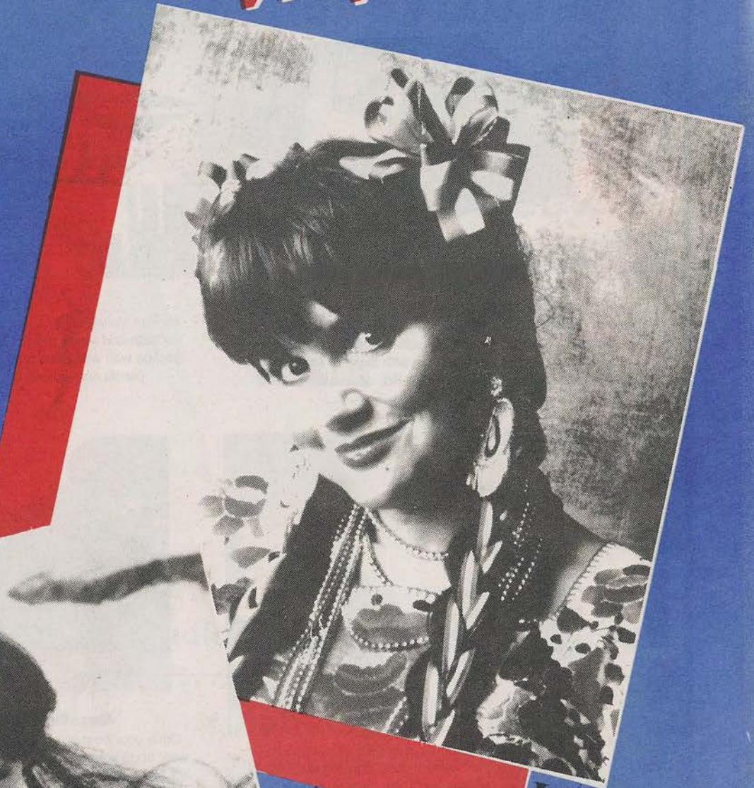
Linda Ronstadt at Sonoma County Fair

Entertainment, Real Estate, Home, Business, Pleasure