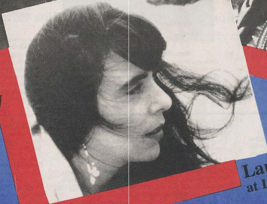
Laura Nyro at Luther Burbank Center